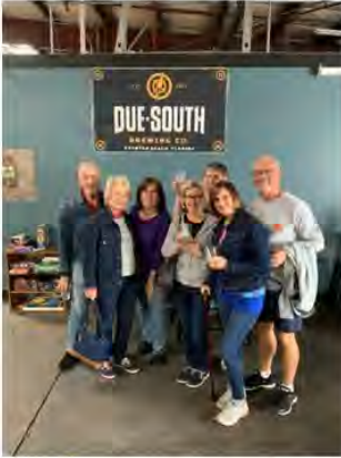
The Contemporaries after Brunch at a Tour November 17, 2019