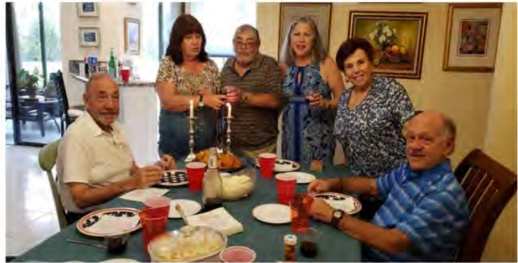
May 2019 Pot Luck Dinner before attending Services at Temple Shaarei Shalom.