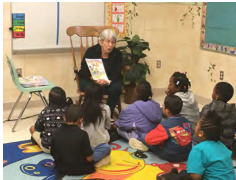
Reading to children at local Elementary Schools

Contact Holly at socialaction@templeshaareishalom.com