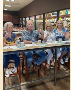
Tequila Tasting @ Total Wine