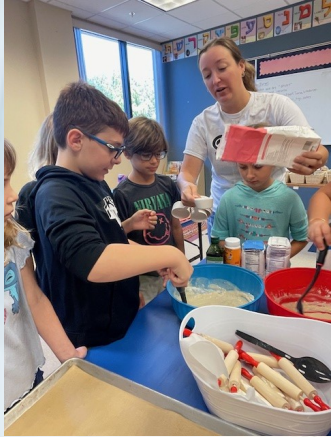
4th Grade Made Borekas