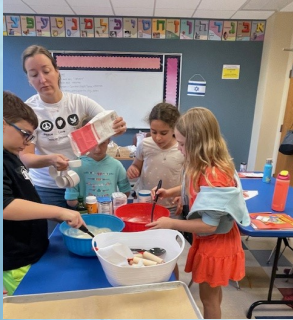
3rd Grade Making Pita