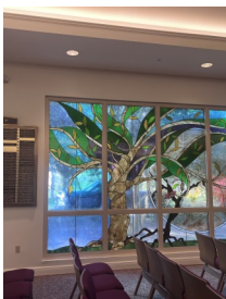
Interior and exterior trim painting