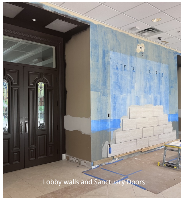
Lobby walls and Sanctuary Doors